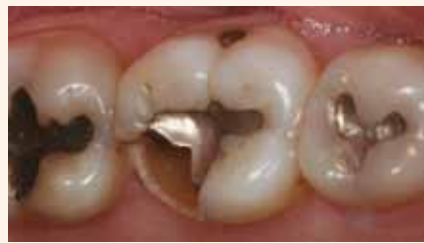
Fig. 4: Broken, unhappy tooth No. 19.