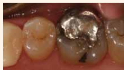
Fig. 1: Large, broken-down amalgam.