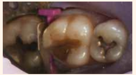
Fig. 6: Self-etch primer.