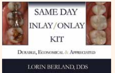
Fig. 10: Same day inlay/onlay CD-ROM cover.