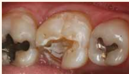
Fig. 7: Final prep.