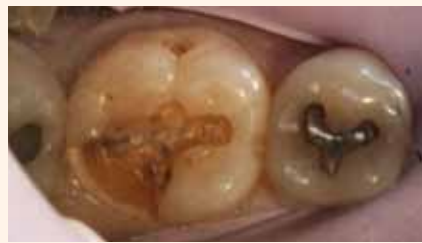
Fig. 5: Amalgam and caries removed showing dentinal floor fracture.