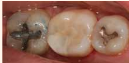
Fig. 9: Happy tooth, happy patient.