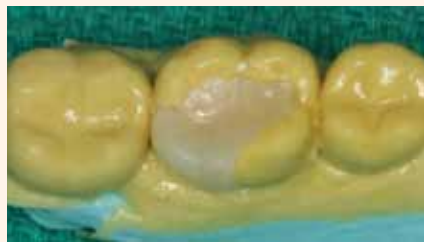
Fig. 8: Onlay on model.