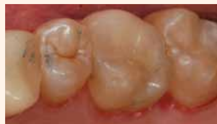
Fig. 2: Immediate post-op, occlusal.