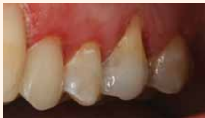
Fig. 3: Immediate post-op, buccal.