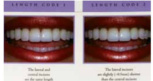
Fig. 4: Length code L-2, laterals slightly shorter than centrals and cuspids.