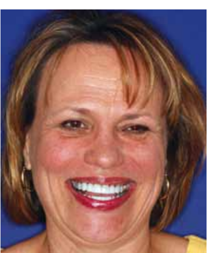
Fig. 11: Provisional full face.