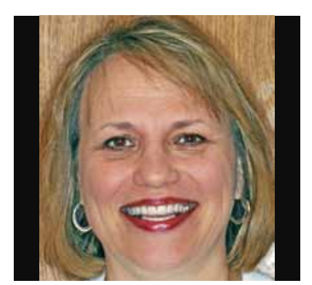
Fig. 5: Cosmetic image.