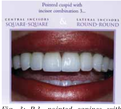
Fig. 3: P-3, pointed canines with square centrals and round laterals.

First, the instant silicone model was lubicated with a water-based lubricant such as KY Jelly. Next, the putty matrix was filled with bisacryl and then placed onto the silicone model. After a minute and a half, the