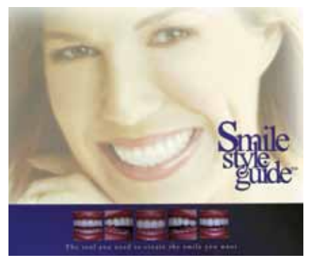
Fig. 2: Smile Style Guide.

Dental) was then placed directly onto the Mach-2 for a model base.