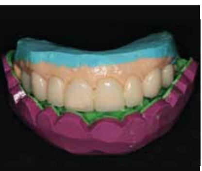
Fig. 9b: Indirect provisionals on instant silicone models.

Each step of this process gained more of the patient's acceptance of the proposed treatment, but it was the extra steps that ultimately gained the patient's appreciation of the final results. 🔲