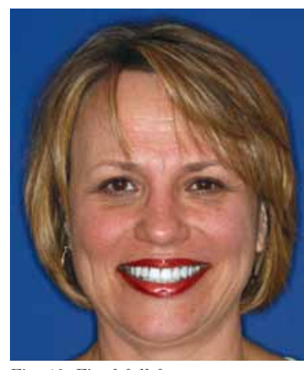
Fig. 12: Final full face.