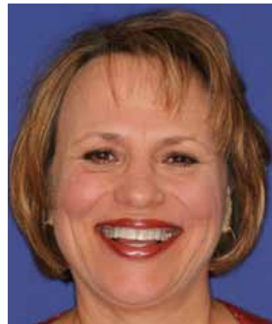
Fig. 7: Slip-On Smile full face.

The teeth were cured from all angles with the FLASHlite Magna (Discus Dental). Because it is a LED, there is little danger of over-heating the teeth.