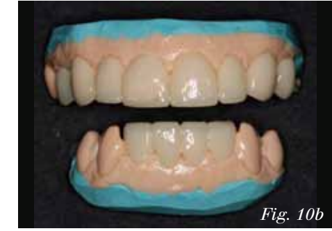
Figs. 10a-c (above, left and below): Upperand lower indirect provisionals on instant silicone models.