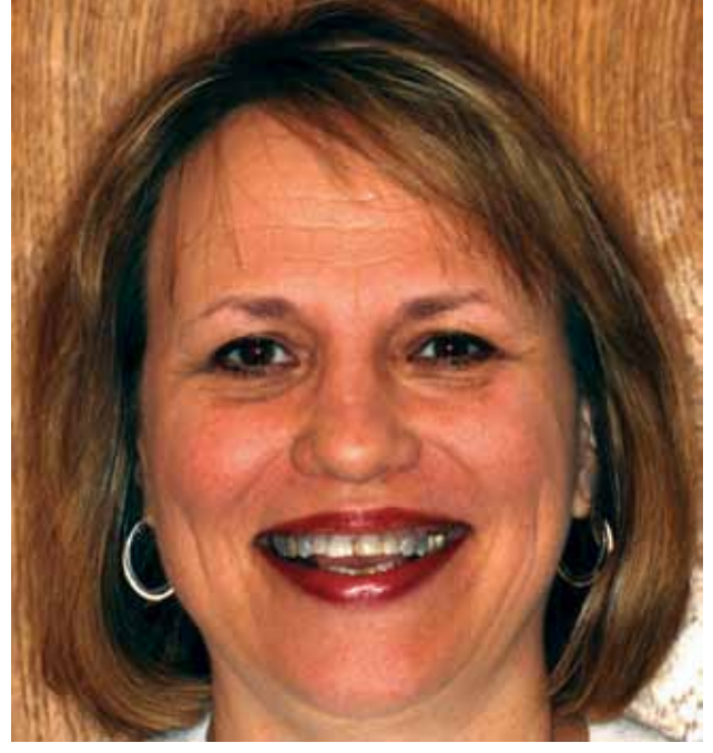
Fig. 1a: Pre-op full face.

At her second consultation appointment, we confirmed the smile design and length combination she had previously selected by showing her a diagnostic wax-up of her upper and lower teeth (Fig. 6). Matrices were fabricated from the wax-ups before this appointment and were used to make an upper and lower Slip-On