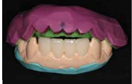
Fig. 9a: Indirect provisionals on instant silicone models.

Once the restorations were seated, the patient was ecstatic with the results. She simply could not believe how natural her teeth looked.