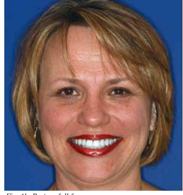
Fig. 1b: Post-op full face.

We used this as a base shade, planning to make the lower veneers even lighter toward the front and the upper veneers slightly lighter than the lowers. As planned, teeth Nos.