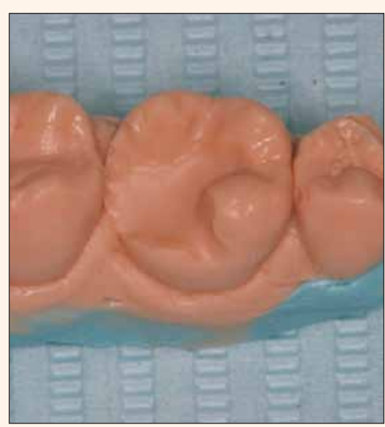
Fig. 7: Silicone model.