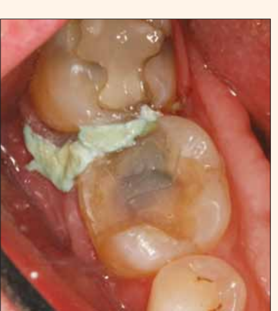
Fig. 11: Expasyl prior to seat.