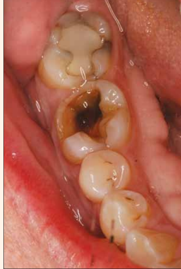
Fig. 1: #30 pre-op.

The Isolite was placed to obtain a dry, and illuminated field. We used caries detec-