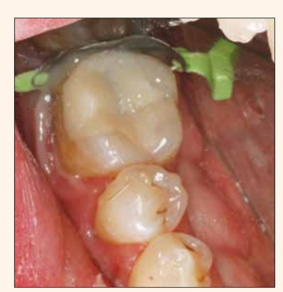
Fig. 14: Seating onlay.