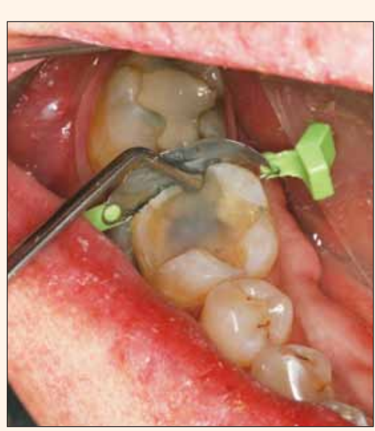
Fig. 13: Adapting FenderMate.