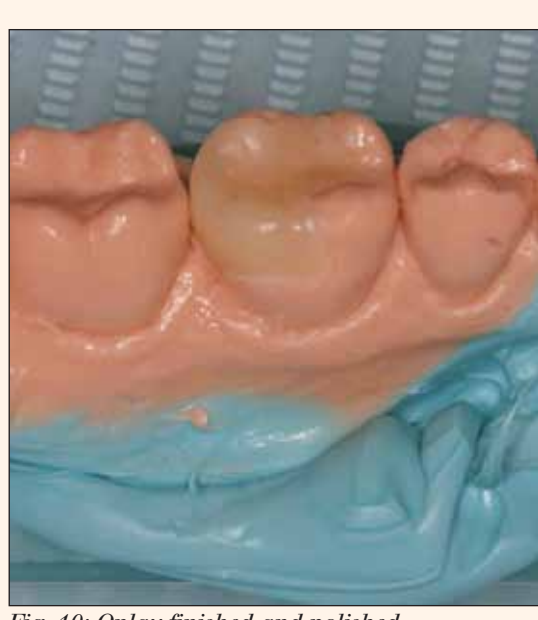
Fig. 10: Onlay finished and polished.