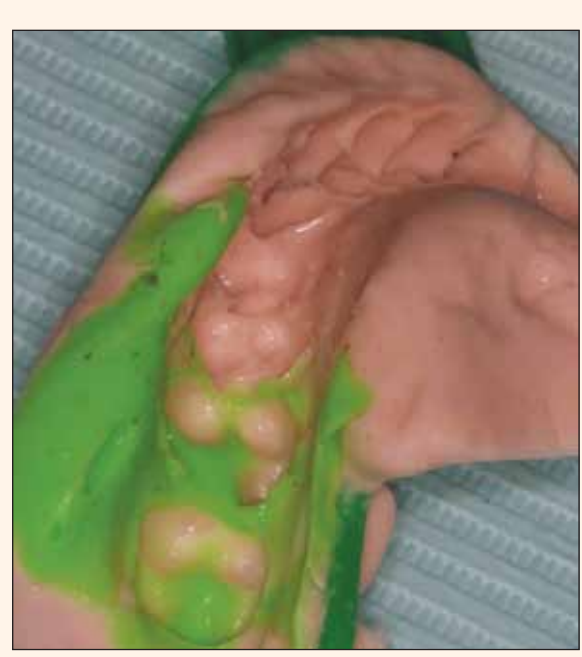
Fig. 5: Identic hydrocolloid impression.

After disinfecting the impressions, the assistant immediately poured them with MACH-SLO (Parkell, Inc.) and based them with a rigid, fast-setting bite registration material such as Blu-Mousse (Parkell, Inc.) (Fig. 6).