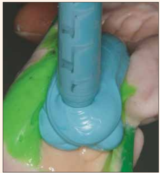
Fig. 6: Basting the poured impression.