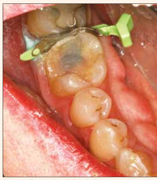
Fig. 12: Expasyl and FenderMate prior to seat.