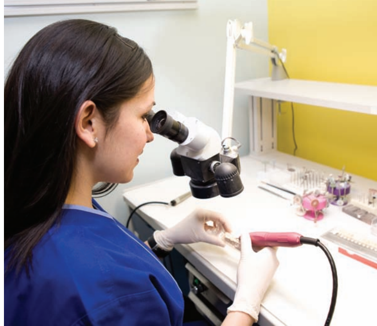
The Berland Dental Laboratory located on site has its own master ceramist and allows the doctors to deliver faster and more personal care.

In order to provide the utmost care, an i-CAT scanner was added to aid in implant cases. Three dimensional imaging with the i-CAT scanner clearly visualizes the anatomy of the jaws, teeth and other critical structures in precise detail. This elimi-