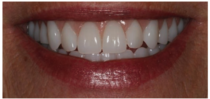
Dr. Berland created a beautiful smile by replacing old dentures with new Face Lift Dentures. With the All-on-4 procedure, these do not come out.