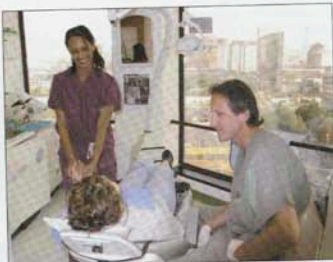
All of our treatment rooms are enclosed and private, each with floor-to-ceiling windows and dramatic views

In an effort to meet the demands of a clientele that seeks elective, cosmetic dental procedures, I believe dentists should consider unique treatments designed to cater to today's increasingly widespread tastes. These dental spas provide