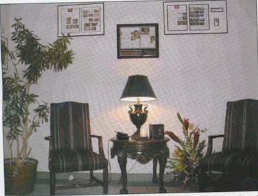
The inviting reception area is filled with the calming scent of lavender aromatherapy candles and the sounds of soothing music

In pursuit of that more attractive smile and look, a trip to your favorite dental spa wouldn't be complete without enhancing your skin with the increasingly popular facial treatment called microdermabrasion. We have